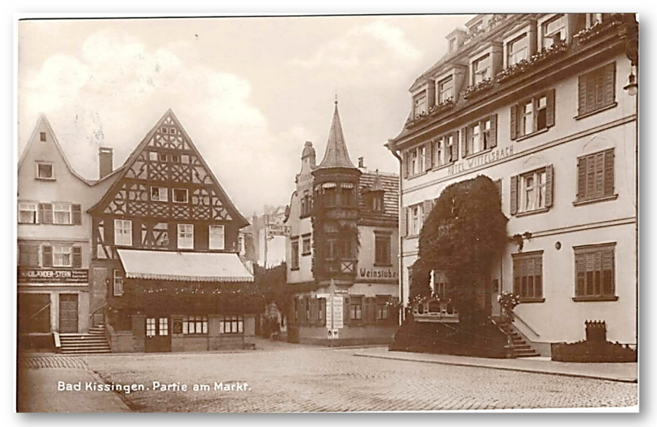
Im Wittelsbacher Hof in Bad Kissingen werden deutsche Wissenschaftler nach dem Ende des Zweiten Weltkriegs in Europa festgehalten – Japan ist noch nicht besiegt – die beiden Atombomben sind noch nicht abgeworfen.

new forced home on former enemies. The British employed about 200 German scientists at the Buma Works in Australia to perfect fuel